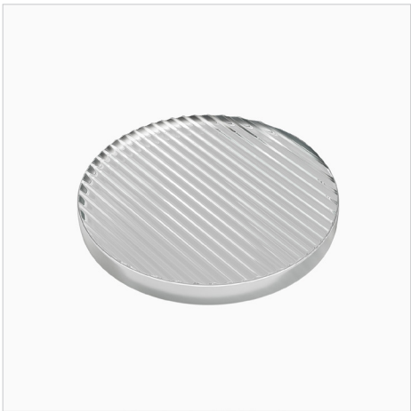
Linear Spread Lens: ALSL