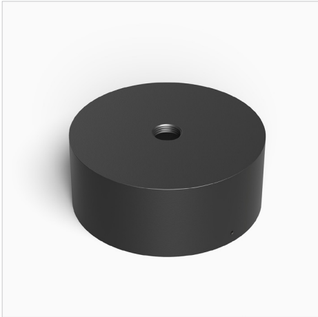
5" Weatherproof Round Surface Mount Box: ACB5.5-BK