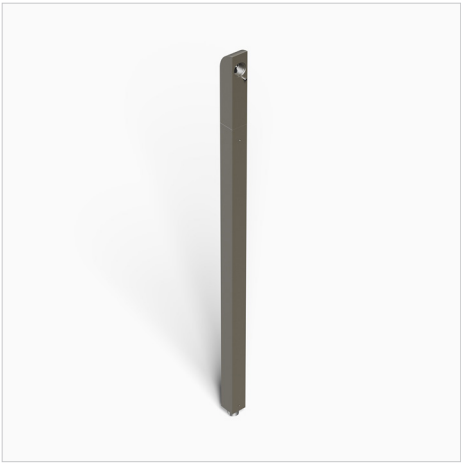
24" Single Flood Extension: AEXF-S-24-BZ