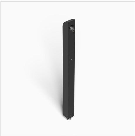
12" Single Flood Extension: AEXF-S-12-BK